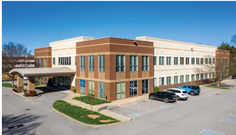
Generous parking availability ensures convenience for both patients and their guests.