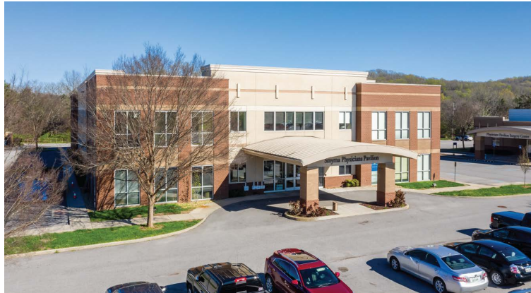
Covered drop-off area creates a welcoming entry experience for patients and guests.