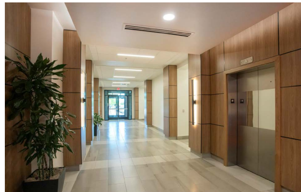
Interior lobby creates a welcoming experience for patients and guests.