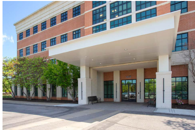
Exterior porte cochère enhances patient access.