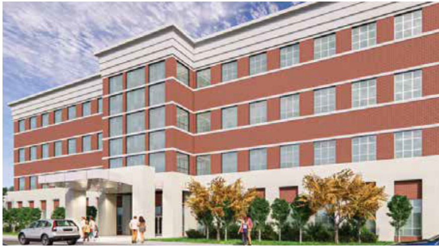
Exterior porte cochère enhances patient access.

Stonegate Center | 1639 Medical Center Pkwy | Murfreesboro, TN | 37129