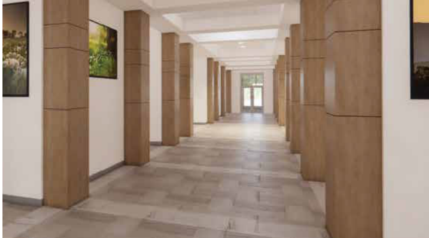
Interior lobby creates a welcoming experience for patients and guests.