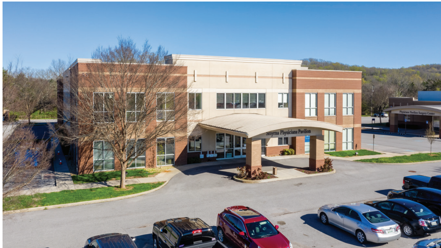
Covered drop-off area creates a welcoming entry experience for patients and guests.

Smyrna Physicians Pavilion | 537 Stonecrest Pkwy | Smyrna, TN | 37167